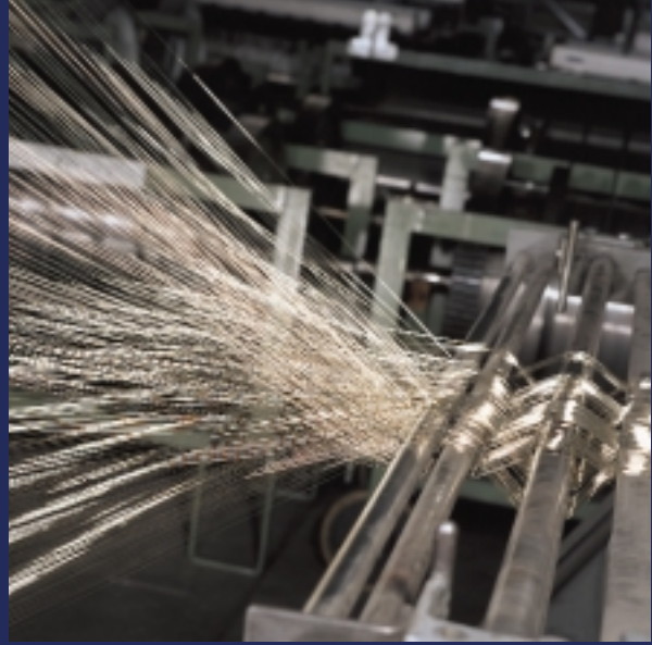
Preparation of warp drum