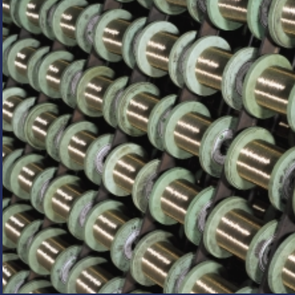
Spools of wire