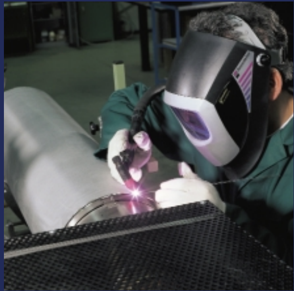
Welding of POROSTAR® filter candles